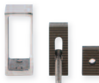
Track Holder Fittings for Wall