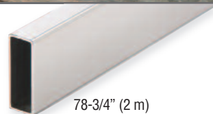
78-3/4" (2 m) Header Bar Low Profile 1-9/16" (40 mm) Height